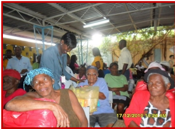
"Thank God for Grace..."