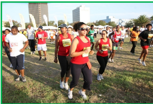
"Jog on the spot, 1, 2, 3..."