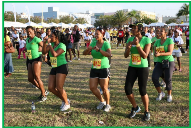
"I must get fit."