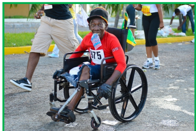
"See you at the finish line..."