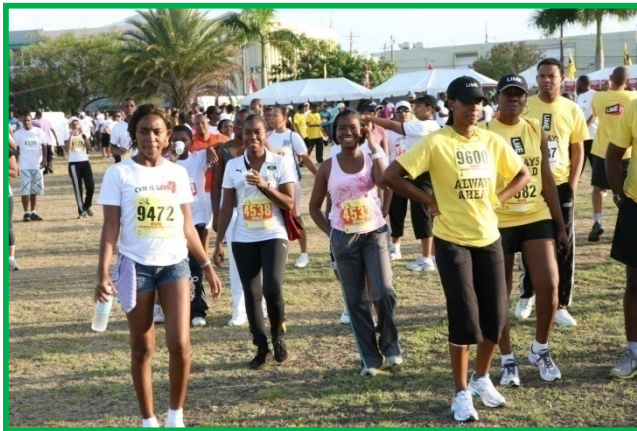
"Ready for warm up!"