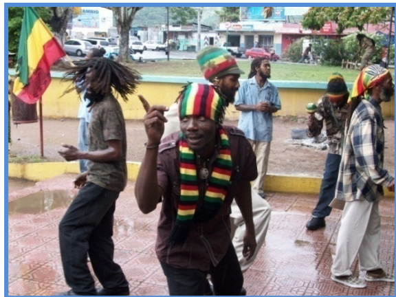
3 rd Place, "Jah Jah Blessing."