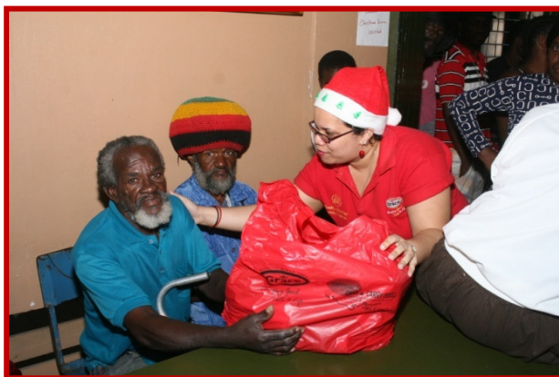
"This is for you."