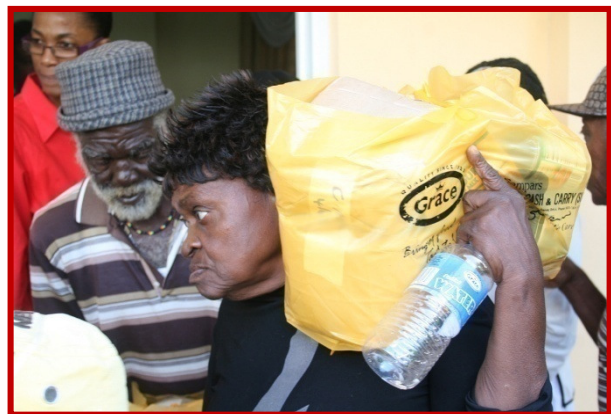
"The load is heavy but I must press on."