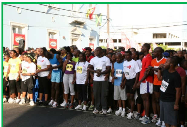
"Obediently toeing the line."