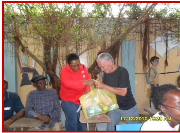
"Here you go Sir!"