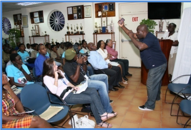
Give it your best shot!