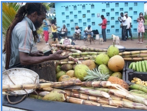
2 nd Place, "Anything & Everything."