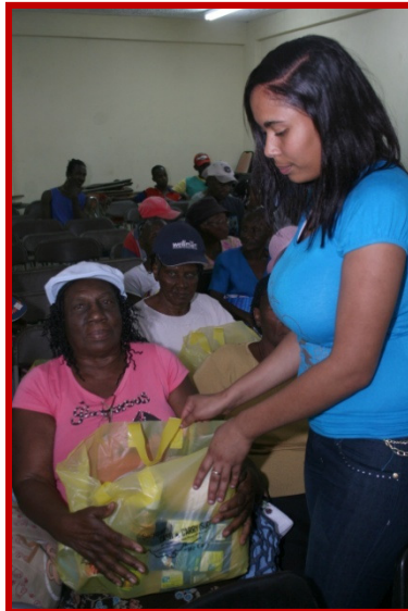
"Happy Holidays Mam."